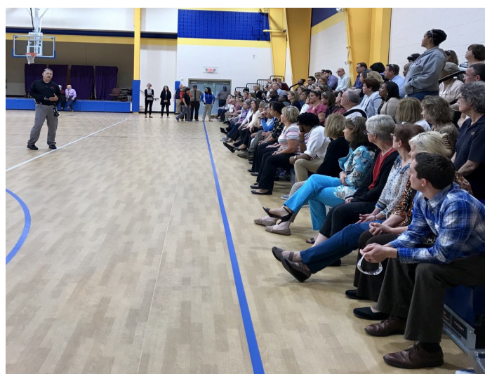
Principals and school leaders learning new ALICE safety procedures. #ADWSaints