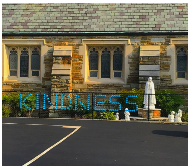
As #ADWSaints, kindness is the daily mission at Blessed Sacrament School