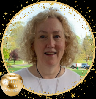
LURANA HOGAN MIDDLE SCHOOL LANGUAGE ARTS TEACHER HOLY CROSS SCHOOL